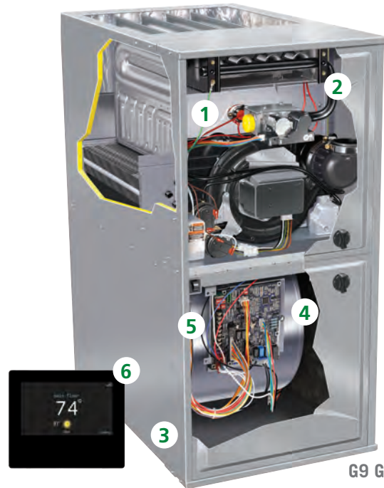
G9 Gas Furnace

Day & Night gas furnaces are designed for durability and comfort. The warmth and efficiency of natural gas combined with a quiet, efficient blower motor delivers comfort throughout the cold seasons. The gas furnace can also be combined with an indoor evaporator coil and properly matched outdoor air conditioner or heat pump to provide cooling during the warm seasons.